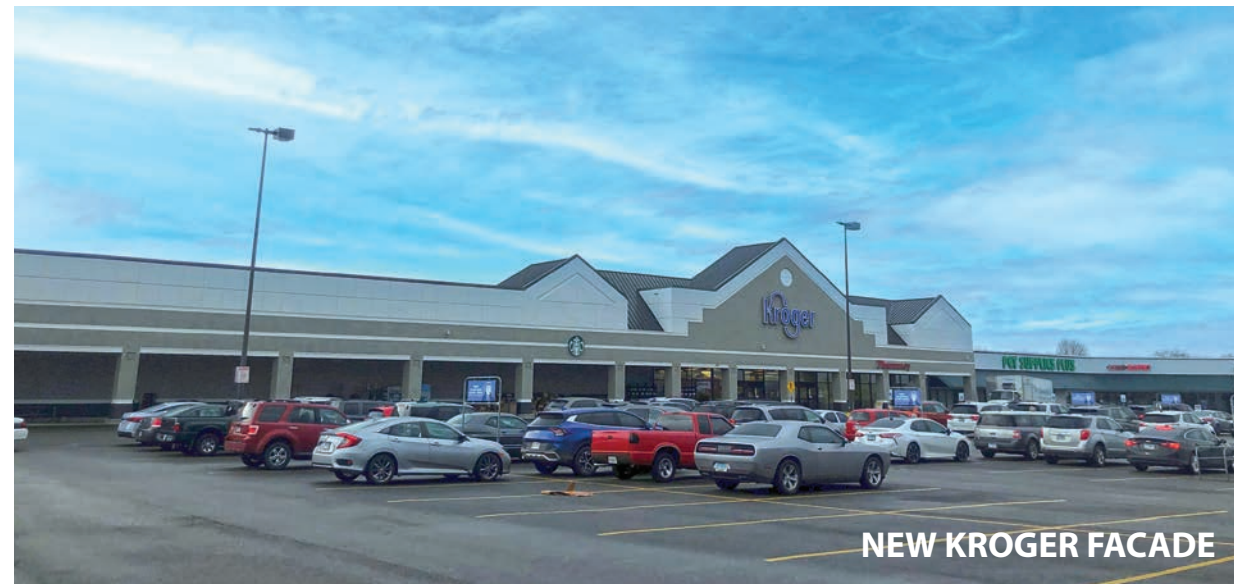
NEW KROGER FACADE